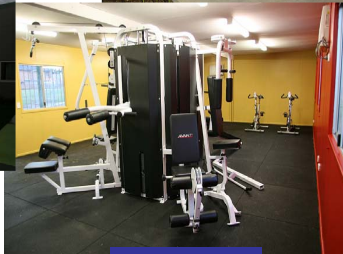
Villawood (Sydney) Gym Facilities