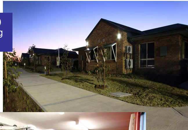
Villawood (Sydney) Residential Housing Centre