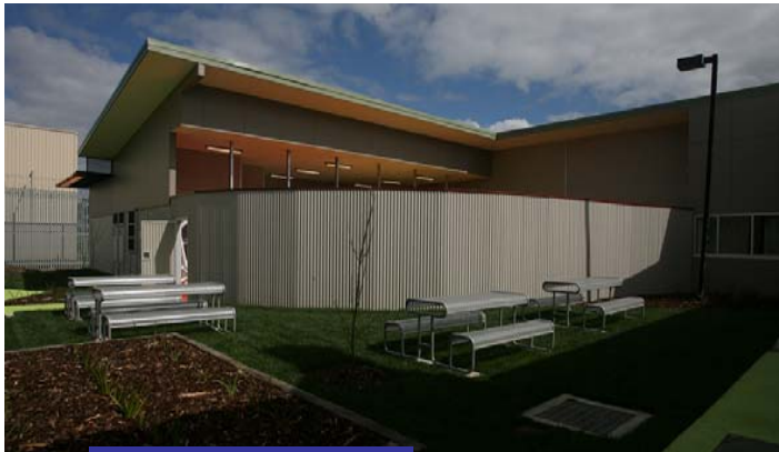
Maribyrnong Outdoor Area